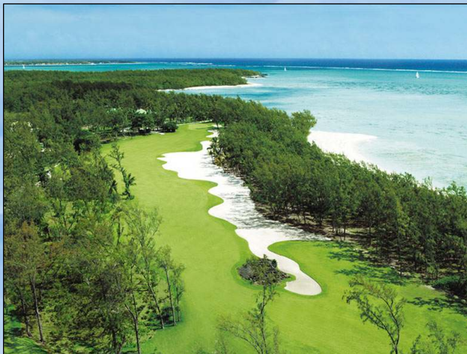
Le Touessrok Golf Course surrounded by crystal clear water lagoon