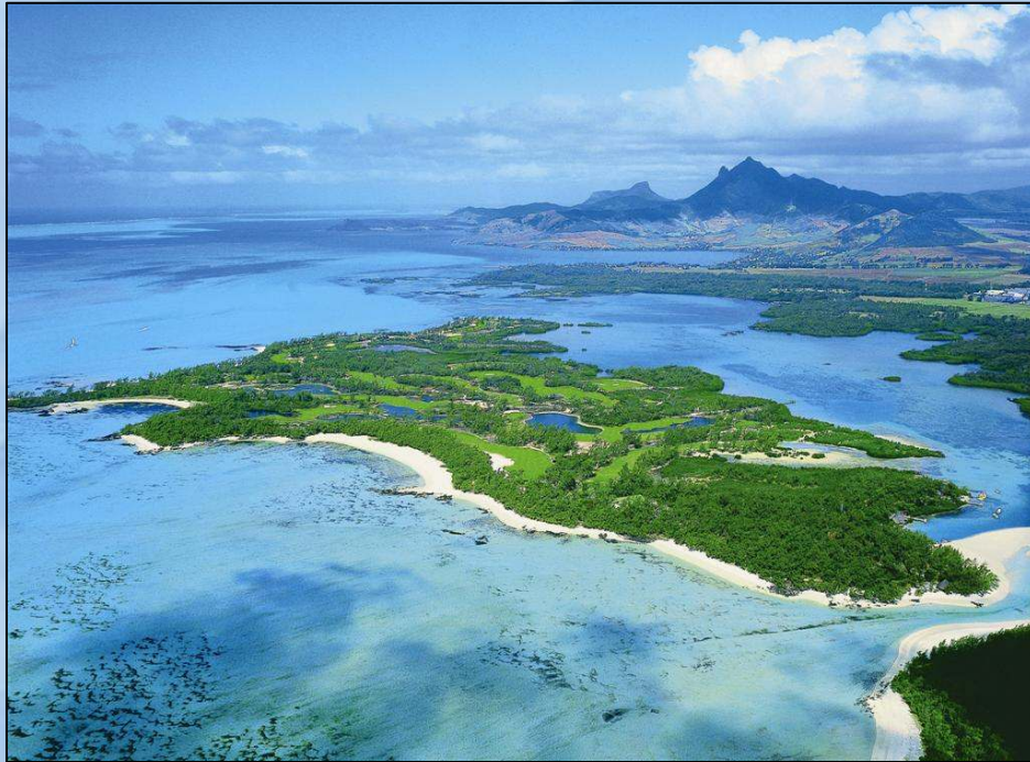
Sky view of the Le Touessrok Golf Course situated on its own private Island